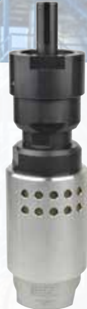
LZB77 2.25 – 2.80 Kw 3.15 – 3.75 hp